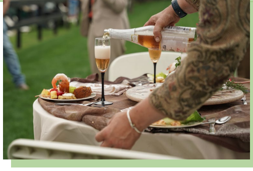
ADS Carriage Show

Black Prong's Classic Under the Oaks is an American Driving Society "Pleasure Driving Competition" and will be held in accordance with the ADS rules. We recommend that all competitors familiarize themselves with the current ADS rule book.