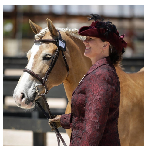
The Whip, August 2020